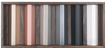
METALLIC GOLD METALLIC COPPER METALLIC NICKEL METALLIC GREY SATIN BLACK SATIN WHITE