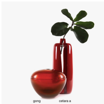
gong cetara a